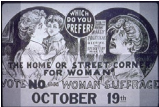
"Which Do You Prefer? The Home or Street Corner for Woman: Vote No on Woman Suffrage" (1915)