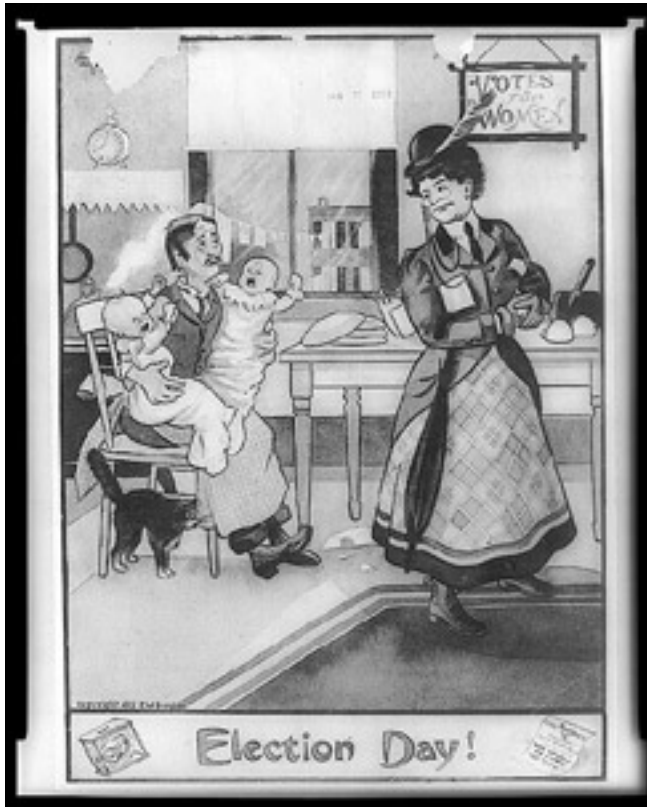
"Election Day 1909" (1909)