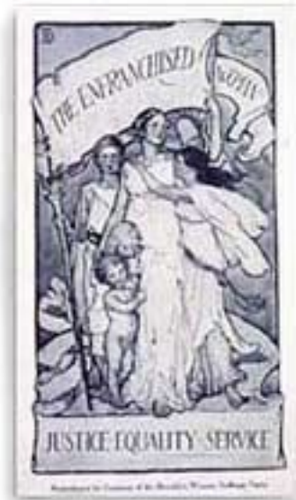
"Idealized Motherhood" (circa 1915)