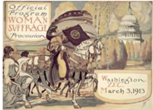
"Official Program Woman Suffrage Procession, Washington D.C., March 3 1913"