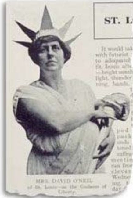
"Goddess of Liberty" (circa 1910)