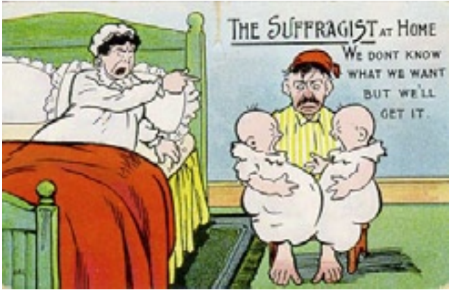
"We Don't Know What We Want" (circa 1908)