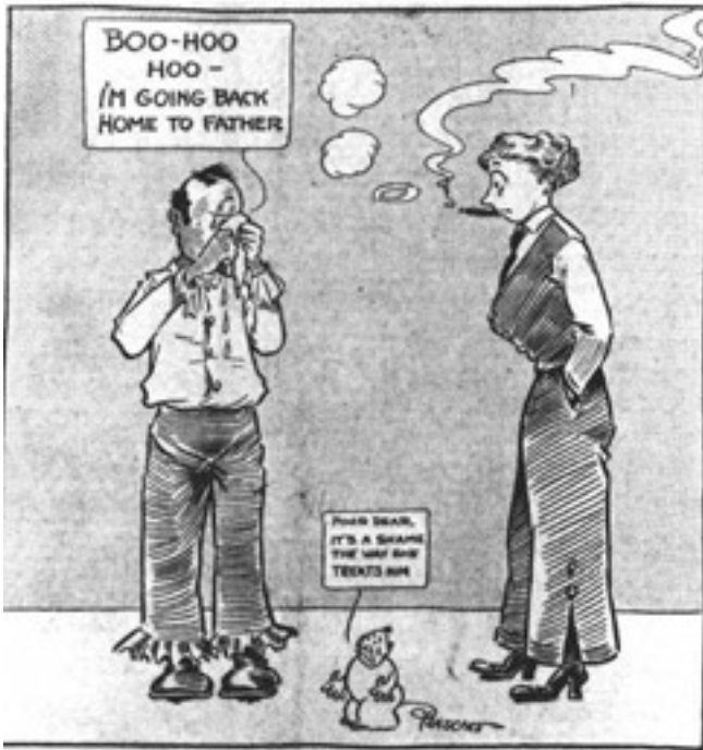
"When Women Have Their Rights" (1913)