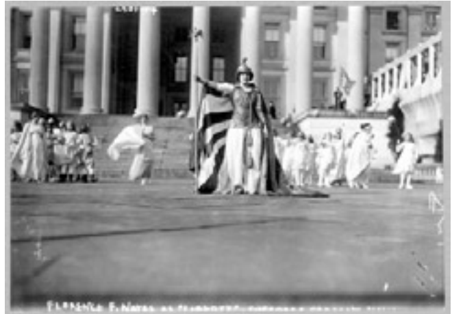
"Liberty" (circa 1913)