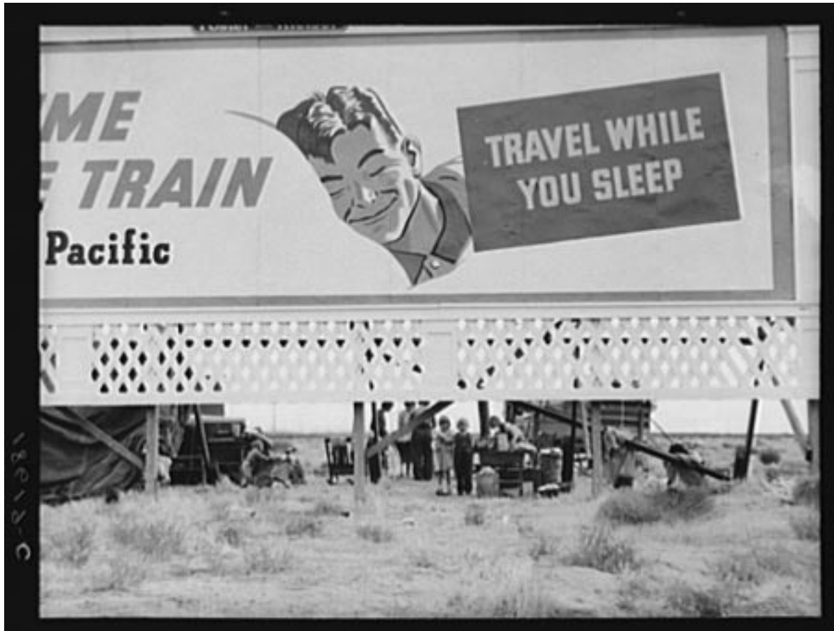
"Camped in the rain behind billboard: three families, fourteen children. On U.S. 99. Near Famosa [or Vamosa], Kern County, California" (Dorothea Lange, November 1939)