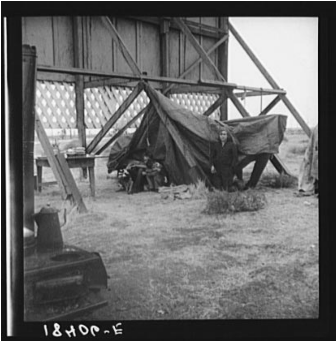
"One of three families camped behind a billboard on U.S. 99. Kern County, California"