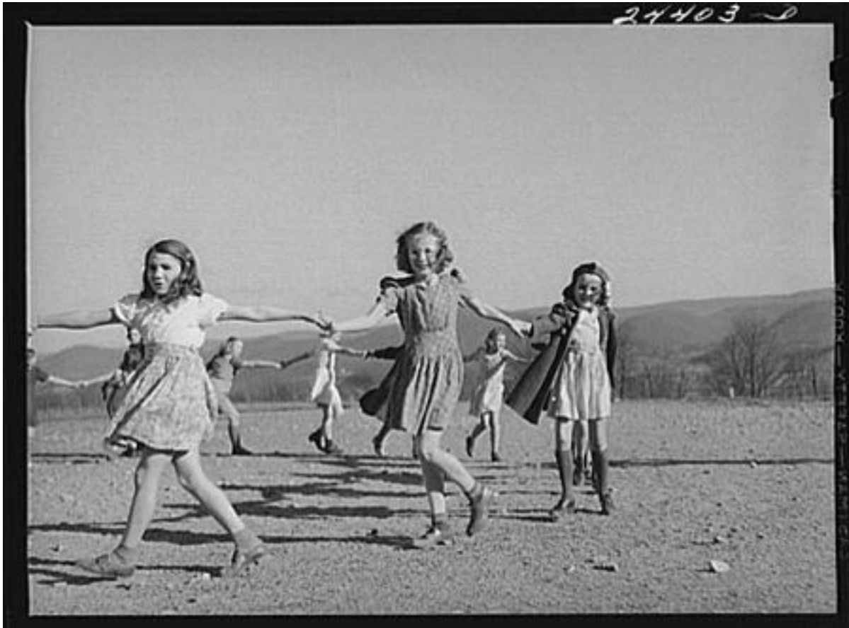
"Children playing a singing game during afternoon play period at homestead school. West Virginia"