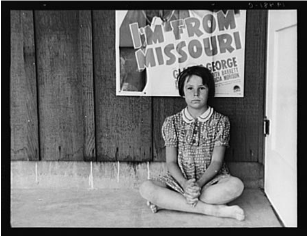
"Advertisement for current movie in town. Westley, California. The child is a flood refugee of March 1939 from southeast Missouri"