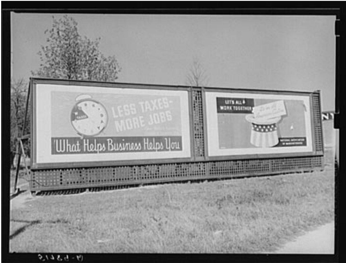
"Highway signs and billboards. Ducktown, Tennessee"