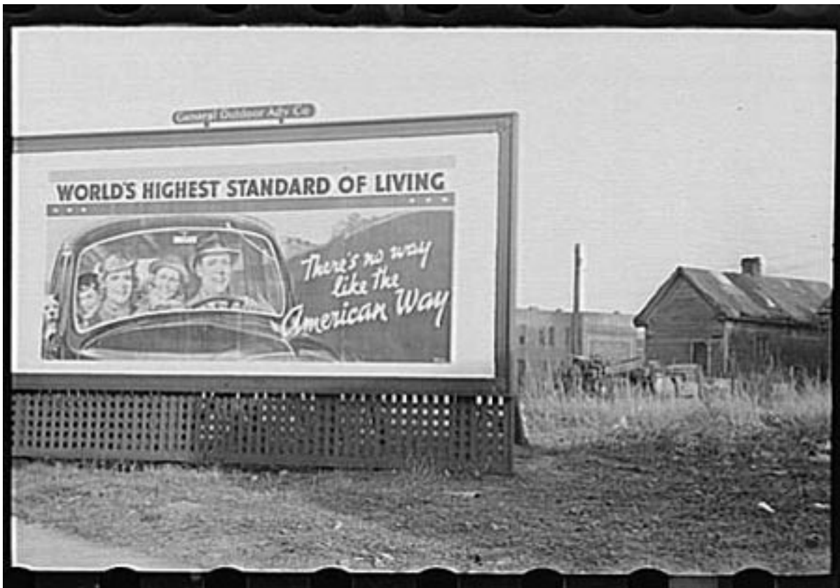
"Sign Birmingham Alabama" (Arthur Rothstein, 1936)