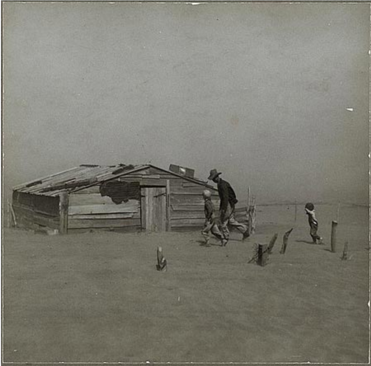
"Farmer and sons walking in the face of a dust storm. Cimarron County, Oklahoma" (Also known as "Fleeing a Dust Storm")