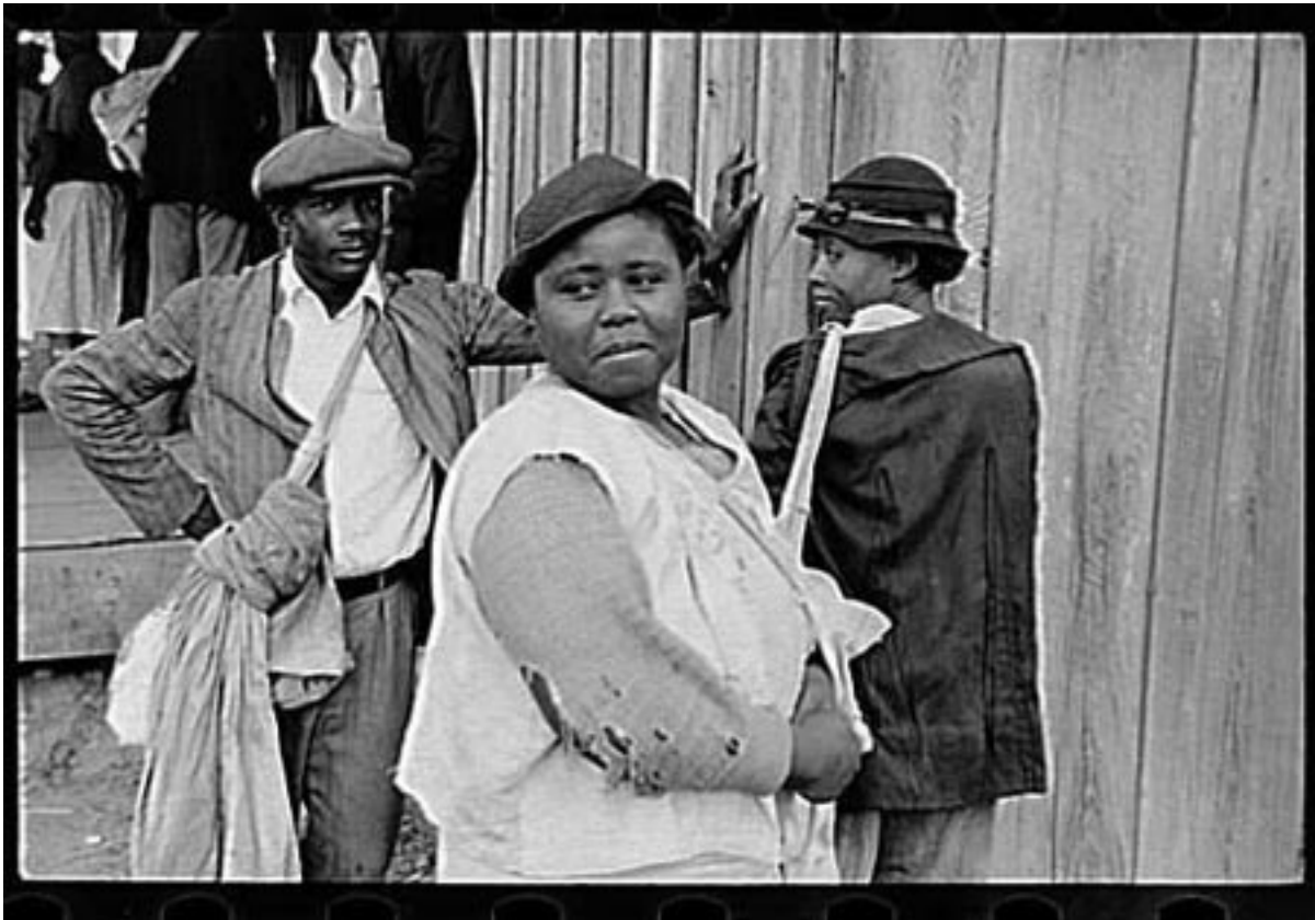
"Cotton pickers, 6:30 a.m., Alexander plantation, Pulaski County, Arkansas" (Ben Shahn, 1935)