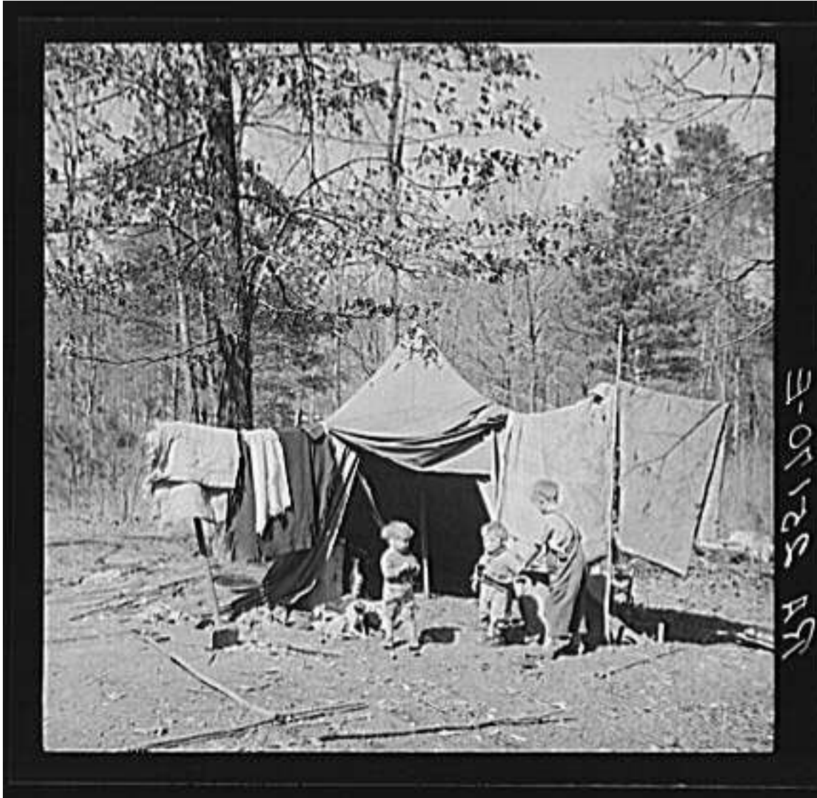
"Children who live in a migrant camp on U.S. Highway No. 31, near Birmingham, Alabama"