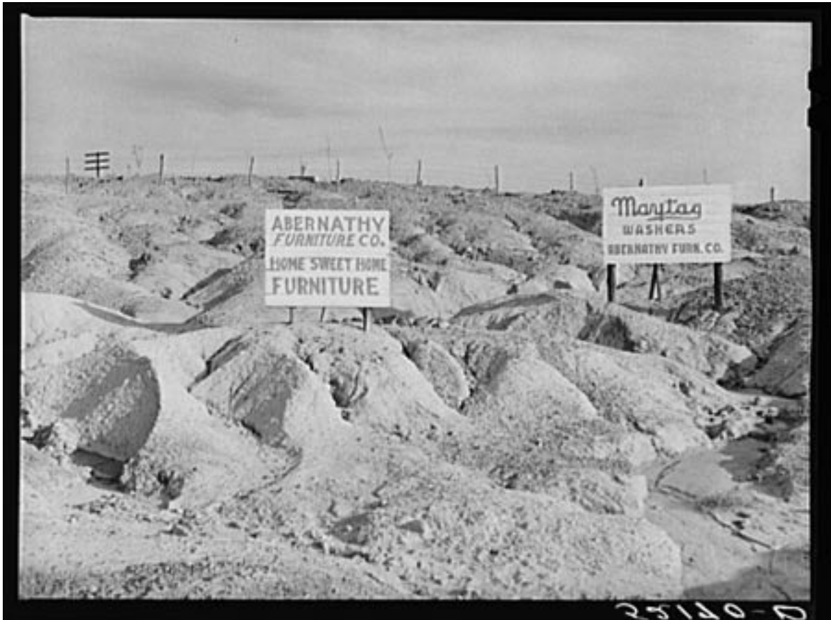
"Highway signboards, southern Alabama" (Marion Post Wolcott, 1939)