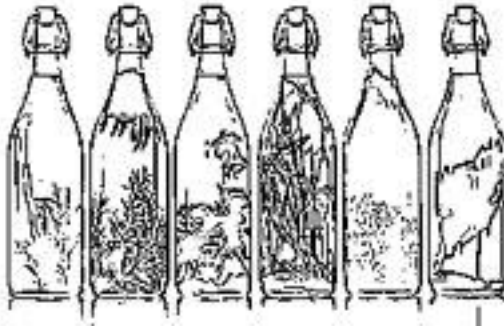
Threshold of 121