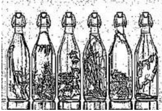
Threshold of 128