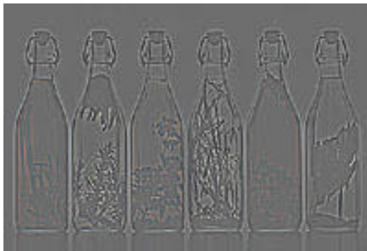
Example of Radius of 2.4