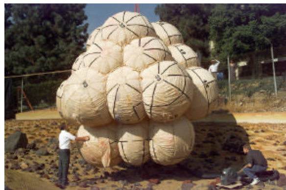
Airbags landing system for Mars Pathfinder.