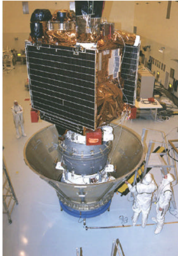
Mars Global Surveyor.

Mars Global Surveyor is a robotic spacecraft designed to study Mars while in a polar orbit around the planet. It was launched from Earth on November 7, 1996. Mars Global Surveyor completed its mission in January 2001, and as it is still orbiting Mars today, it is currently in an extended mission phase. The satellite has returned more data about Mars than all of the previous missions to Mars combined. It has sent back thousands of images including 3-D images of the northern polar ice cap, studied the magnetic field of Mars, found possible locations for water, and studied the Martian moons.