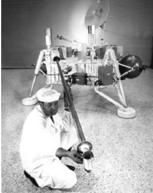
Viking Lander.

Mars Pathfinder landed in an outflow channel littered with many different kinds of rocks. Cameras on the lander sent back over 16,500 images of the Martian surface, and cameras on the Sojourner Rover sent back another 500 more. In addition, Pathfinder completed more than 15 chemical analyses of the rocks and soil, and it studied the wind and weather of the planet.