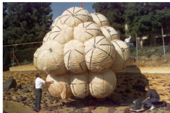
Airbags landing system for Mars Pathfinder.