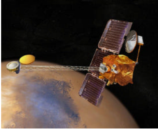
Mars Odyssey.