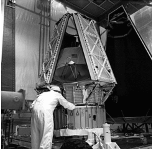
Mariner 9.

Close up images were also taken of the two Martian moons, Phobos and Deimos.