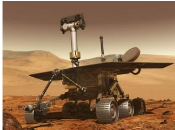
Mars Exploration Rover.

Martian day. With no need to return to the landing site, the Rovers will be able to explore a comparatively large area of the Martian surface. The Rovers, which will land in different areas on Mars, will send back images from their cameras and data about the Martian soils, which they will be able to analyze at very small scales.