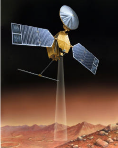
Mars Reconnaissance Orbiter.

Hopefully the data it collects will allow scientists to understand better the location and amount of water on Mars.